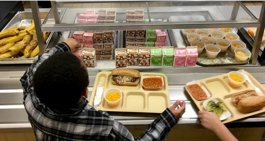
The school lunch line is packed with people each day, and includes healthy options such as juice, fruit, and sandwiches.