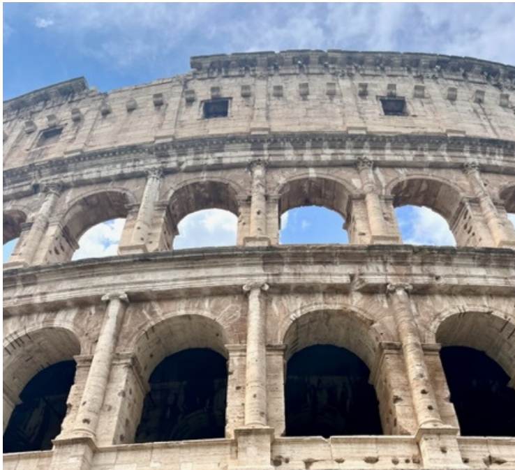
The Colosseum, located in Rome, Italy.