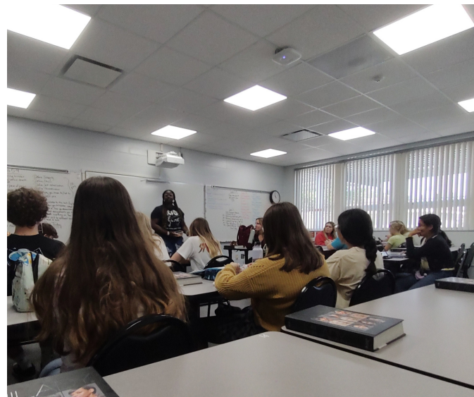
Students meeting during lunch on Monday for SGA.