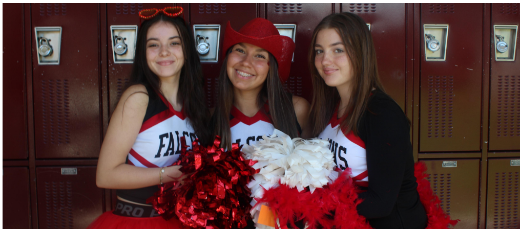
Friday, September 8th was Spirit Day. Pictured above, a group of cheerleaders dress in their best school colors.