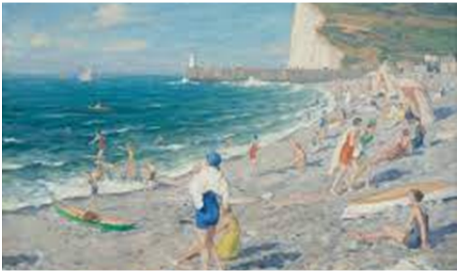
The Painting Sunny Beach Art by: Tavík František Šimon