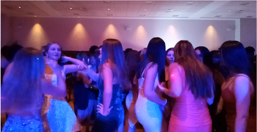
A group of students have fun on the dance floor at Homecoming.