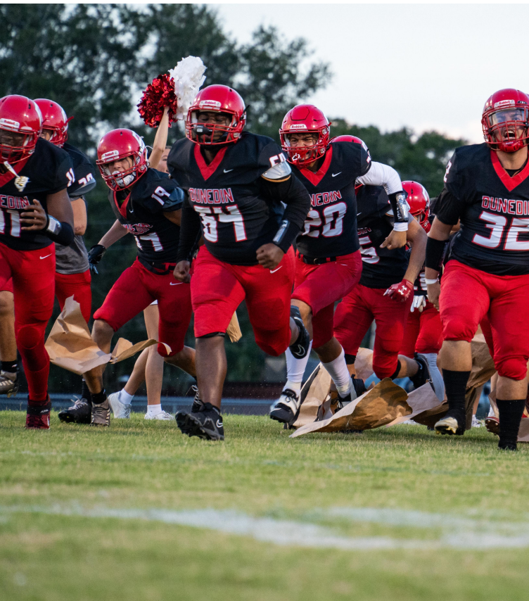
The DHS Football team enters the field during the Homecoming Game