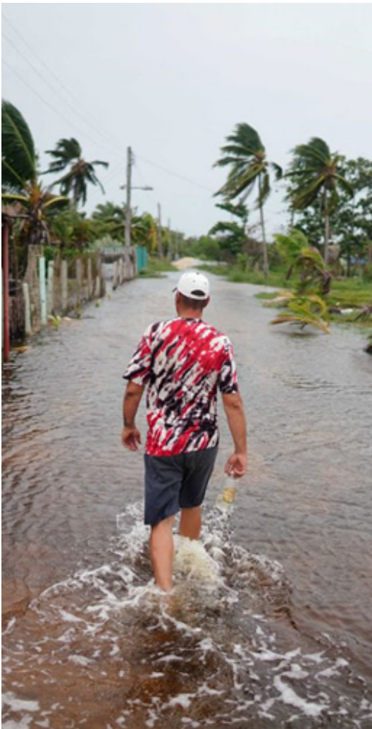
Man walks through flooded road in Cuba.